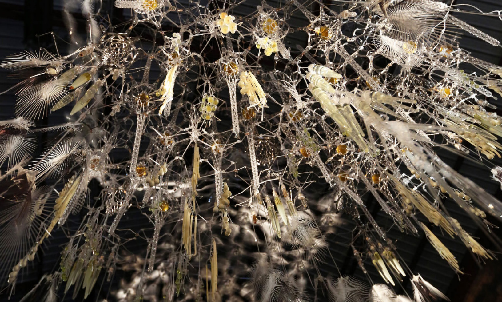
2 Epiphyte Veil, installation view. Maubeuge / Créteil / Lille - 2013.