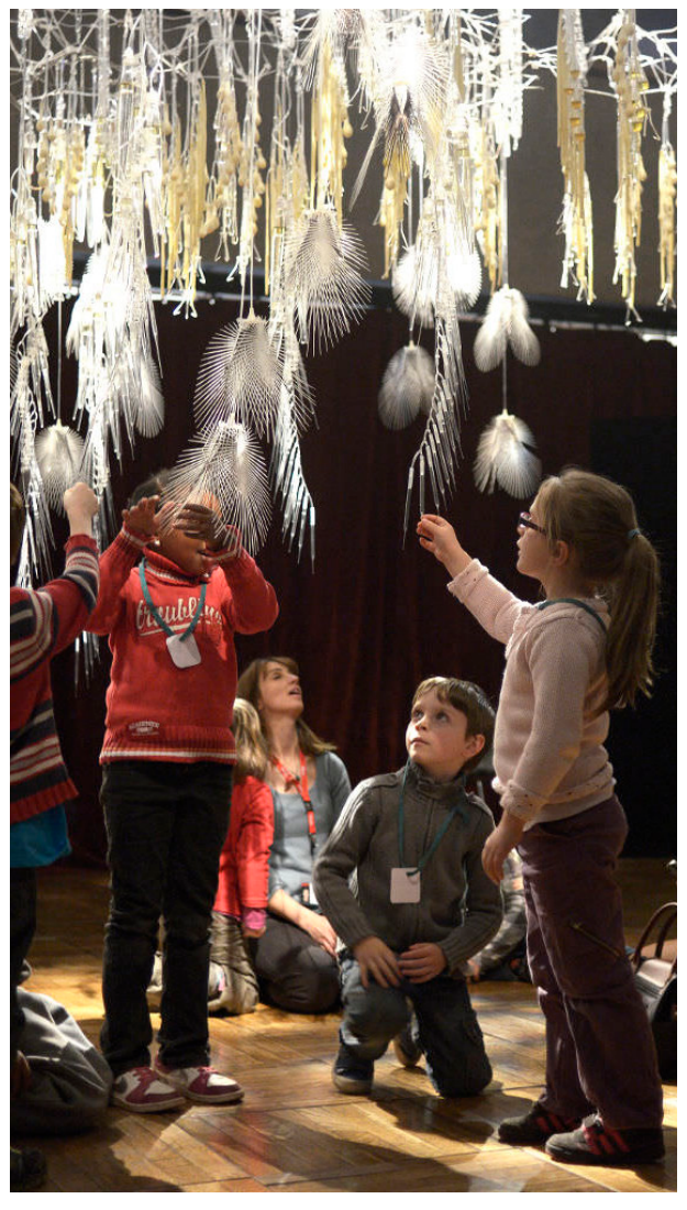
5 Epiphyte Veil, installation view. Maubeuge / Créteil / Lille - 2013.