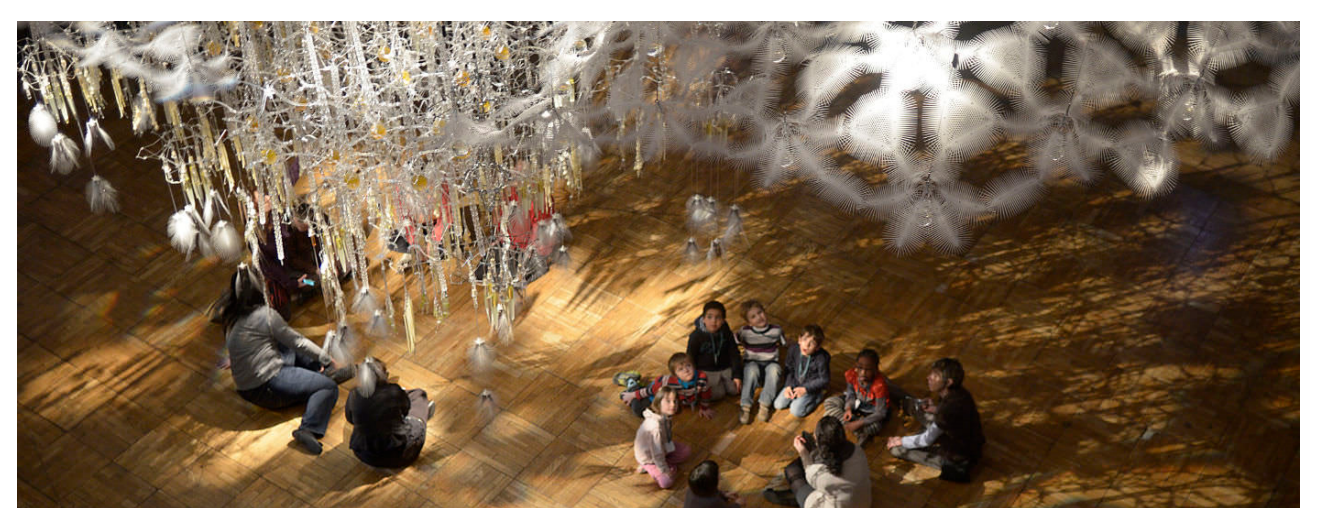
6 Epiphyte Veil, installation view. Maubeuge / Créteil / Lille - 2013.