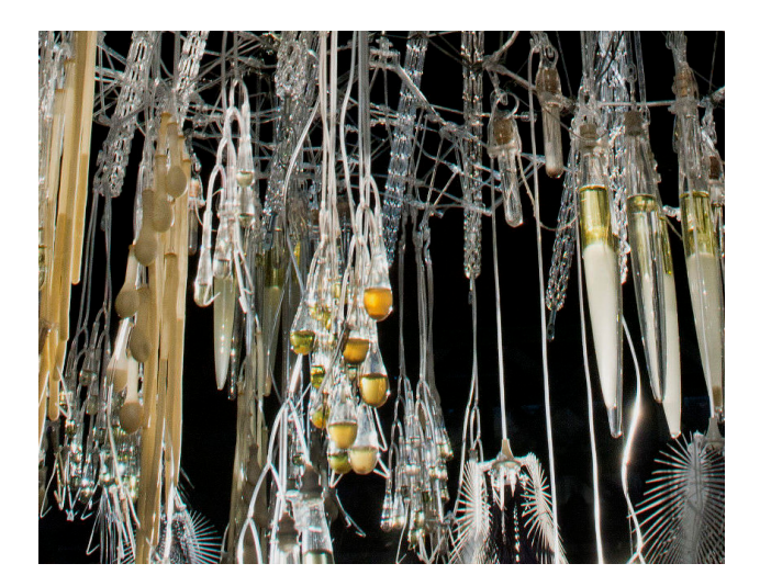
3 Epiphyte Veil, installation view. Maubeuge / Créteil / Lille - 2013.