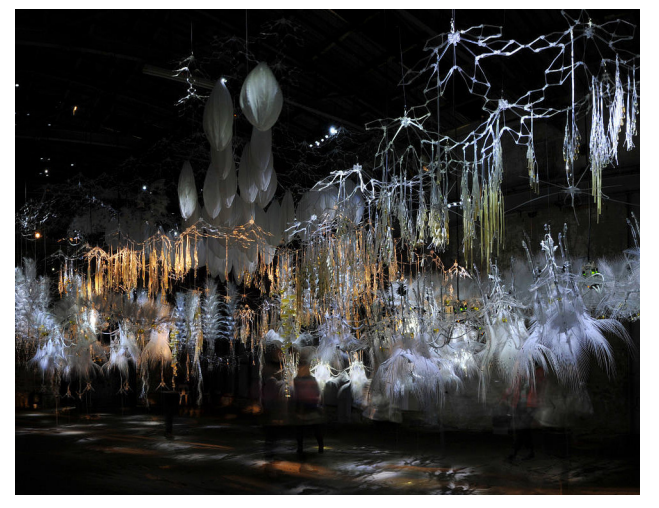
3 Hylozoic Series: Sibyl, Installation view. Sydney, Australia - 2012