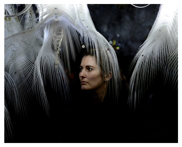
4 Hylozoic Series: Sibyl, Installation view. Sydney, Australia - 2012