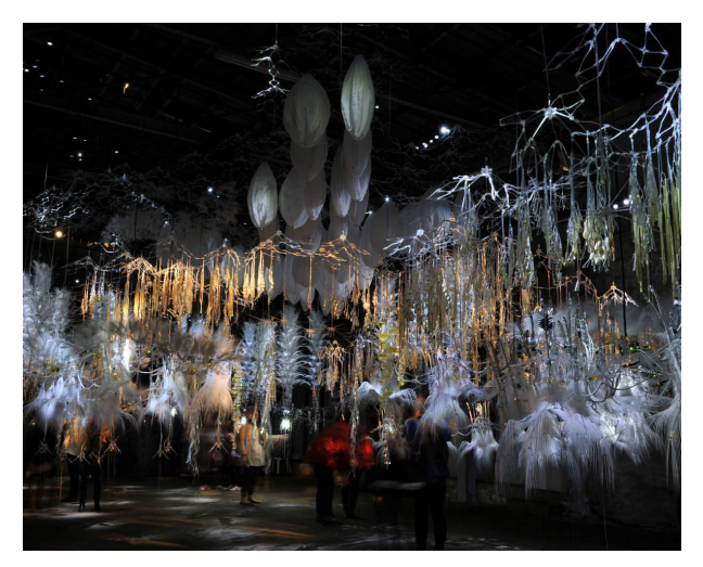
12 Hylozoic Series: Sibyl, Installation view. Sydney, Australia - 2012