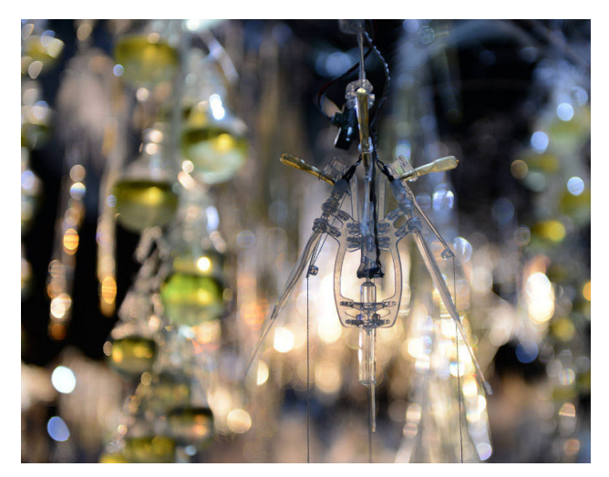
11 Hylozoic Series: Sibyl, Installation view. Sydney, Australia - 2012