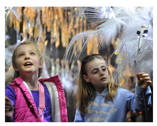
5 Hylozoic Series: Sibyl, Installation view. Sydney, Australia - 2012