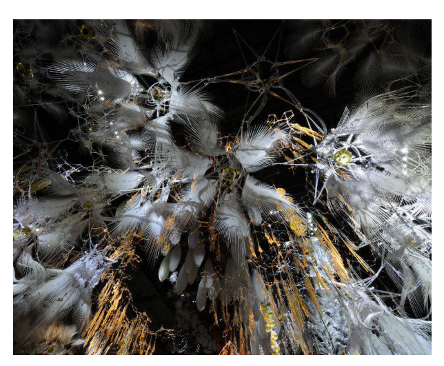
6 Hylozoic Series: Sibyl, Installation view. Sydney, Australia - 2012