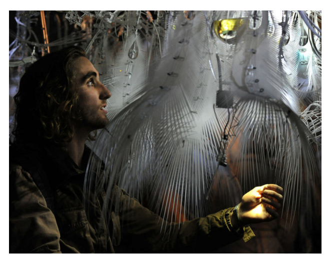
7 Hylozoic Series: Sibyl, Installation view. Sydney, Australia - 2012