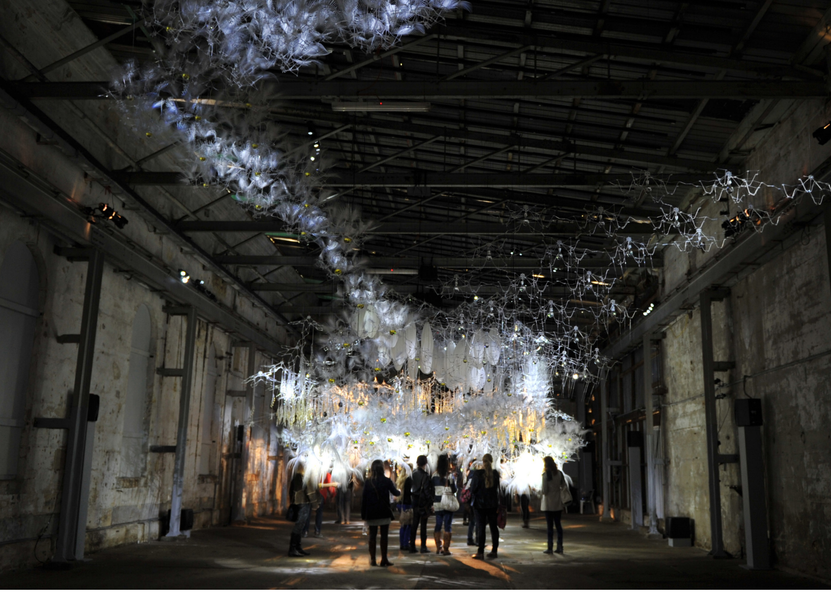
2 Hylozoic Series: Sibyl, Installation view. Sydney, Australia - 2012