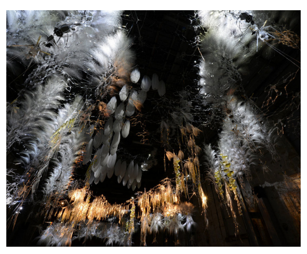
8 Hylozoic Series: Sibyl, Installation view. Sydney, Australia - 2012